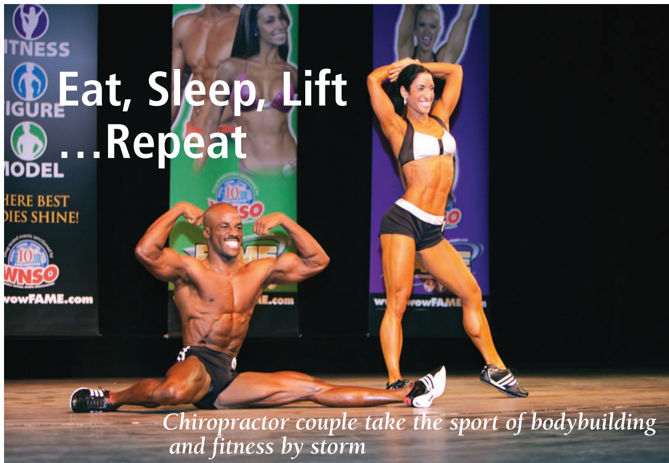
Chiropractor couple take the sport of bodybuilding and fitness by storm